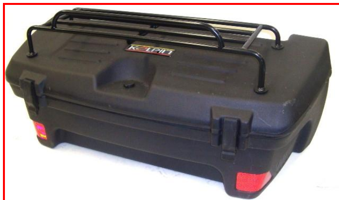
93202 RACK SHOWN ON 93201 BOX